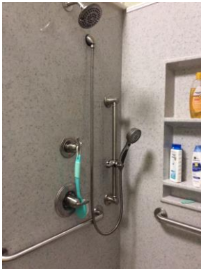
Roll in Shower

said, “We are happy and cannot thank you enough. It’s an old house, but everything turned out well. Thank you so much.”