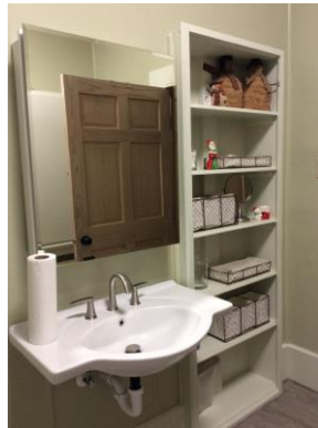
Roll under Sink