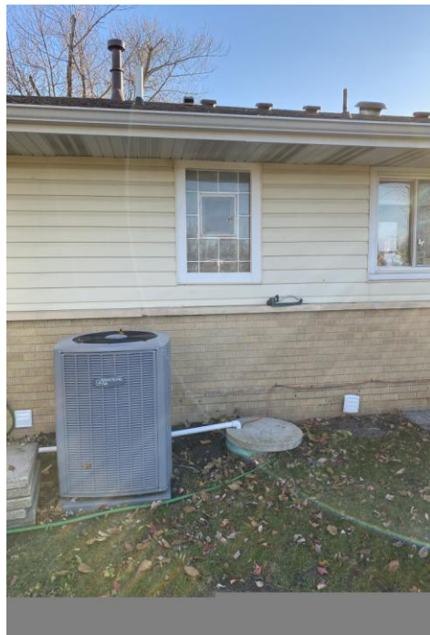
New Armstrong Air Condensing Unit