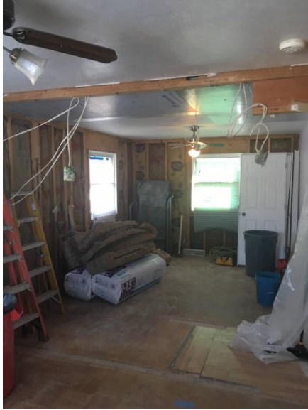
Start of remodel, joining 2 bedrooms