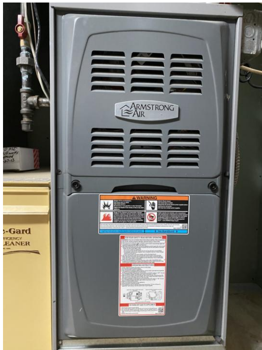
New Armstrong Air Furnace