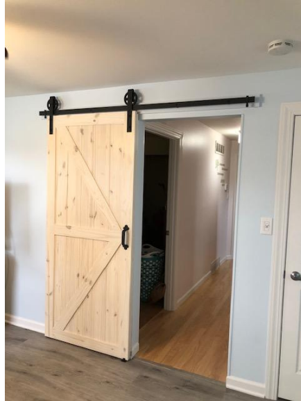
New entry into bath from renovated MBR